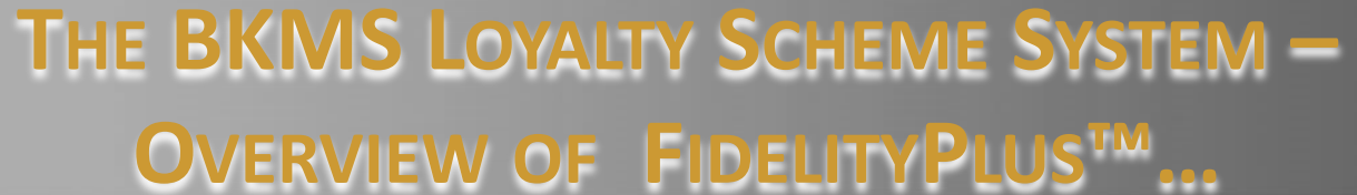
Figure 1 shows the different components for the proposed system and it includes: